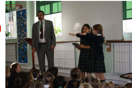
Prayer Drill at St. Francis